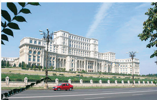
The House of the Republic, Bucharest