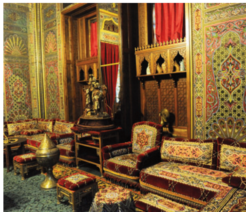
Peleş Castle: Oriental Room