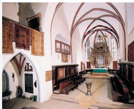
The Monastery Church in Sighișoara