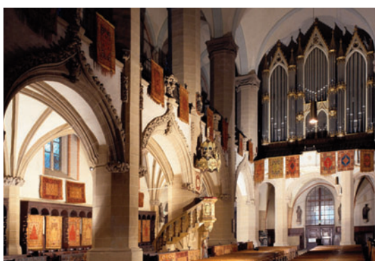
Ottoman prayer rugs in the Black Church