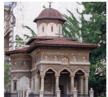
Stavropoleos Greek-Orthodox Church