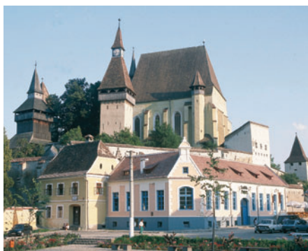
The Lutheran Church in Biertan