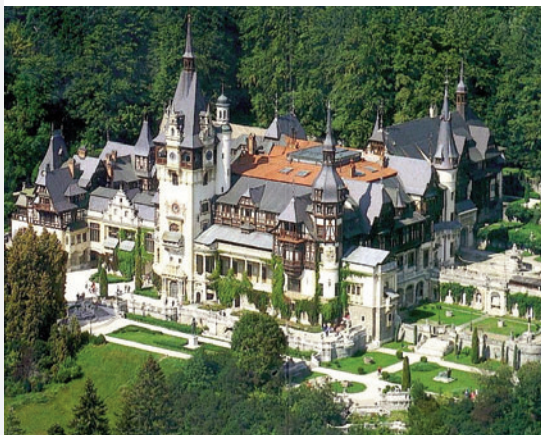
The Peleş Castle in Sinaia