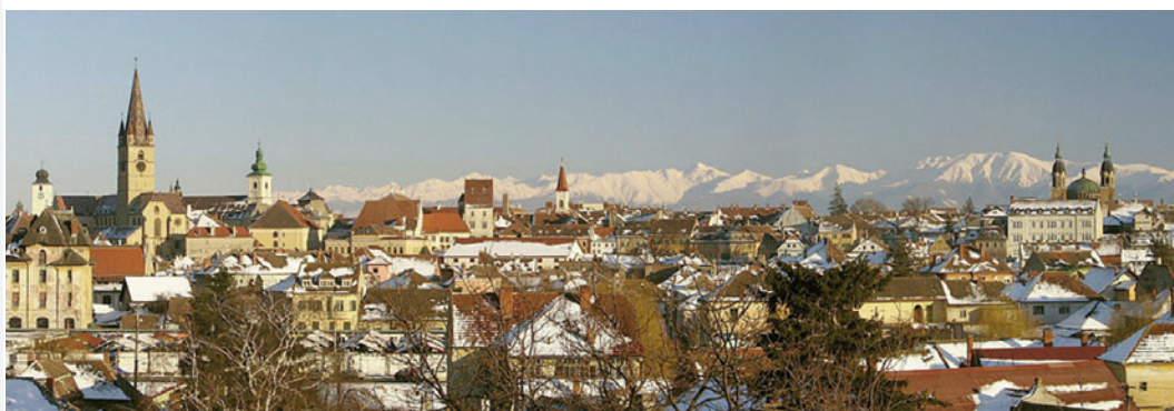
Landscape in Sibiu