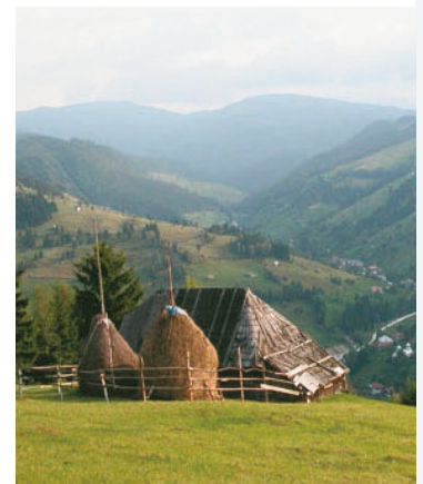
Landscape near Bran