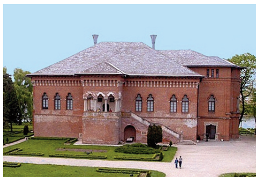
The Mogoșoia Palace