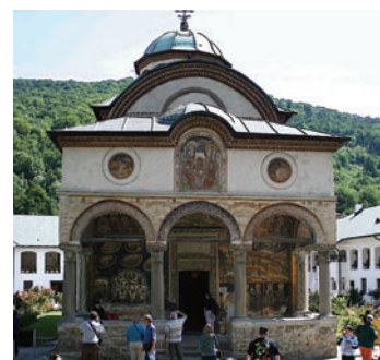
Cozia Monastery, 14th cent.