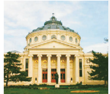
The Romanian Atheneum

7:30 pm - Presentation meeting in the bar of the hotel with a glass of Italian Prosecco; every participant will receive the brochure of the tour with the itinerary in Transylvania and Bukovina; Dinner to be announced e turche.