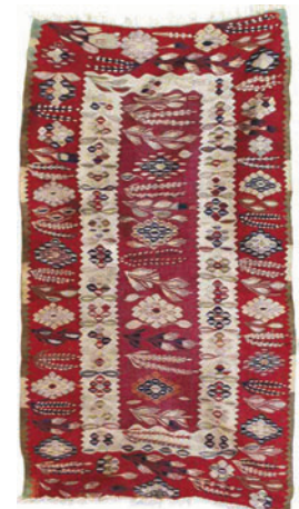
An Oltenian kilim ( scoartza ) Romanian Peasant Museum

5:30 pm - Dinner with traditional food, mititei and eggplant salad.