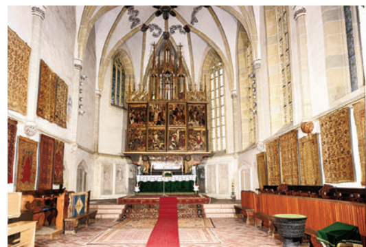
St Margaret's Church in Mediasch