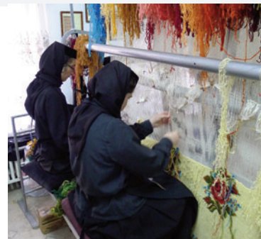
Nuns weaving kilims at Agapia Monastery

7:00 pm - Accommodation in Voroneţ. Optional walk. Dinner at the hotel restaurant.