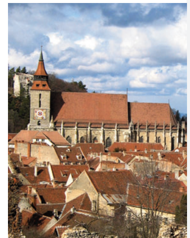
The Black Church in Braşov

8:00 pm - Dinner party at the ‘Shepherd’s House’: local food (sheep cheese and lamb) and folk music. Return to Braşov and stop to admire the town by night.