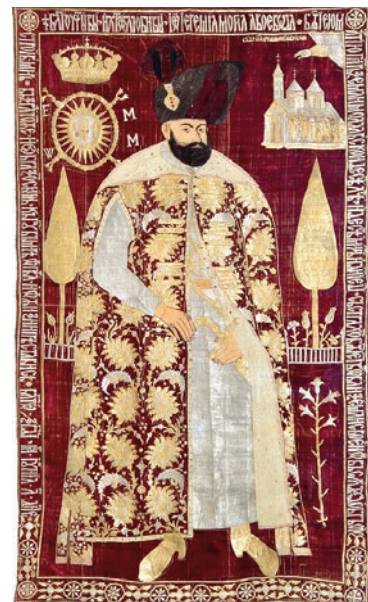
Embroidered tomb cover of Prince Ieremia Movila, Suceviţa Monastery Museum