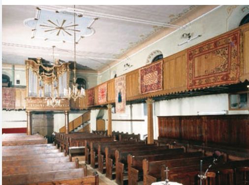
The Hungarian Church in Braşov