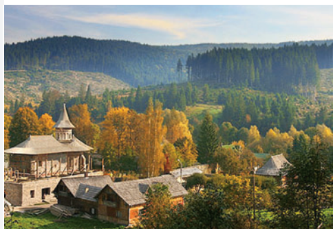
Landscape in Bukovina

In the afternoon we will visit Arbore monastery (1503) and finally the wonderful Voroneţ painted church, with the famous Last Judgement (1547); in the nearby market we can find some locally made textiles. Traditional dinner at the hotel restaurant.