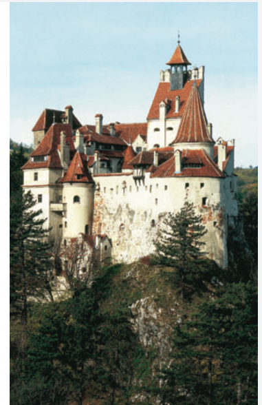
The ‘Dracula’ Castle in Bran